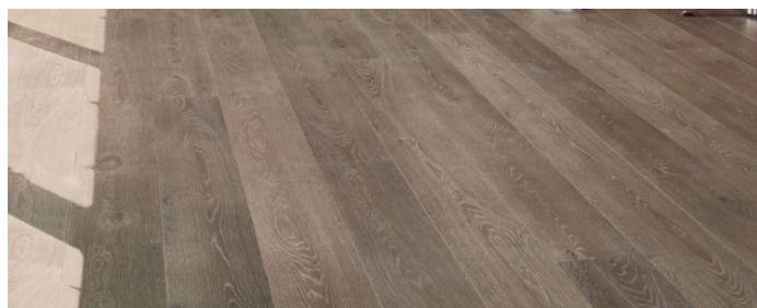
Quick-Step Largo - Grey Vintage Oak

Main Living areas option between: Quick-Step 10 -12mm Laminate Impressive Ultra (Water Resistant) or Largo range selection – Note: Largo not suitable for Laundry Or Up to 600mm x 300mm Floor Tiling from Beaumont Tiles Gold Selection.