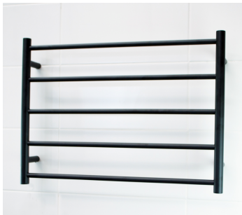
Radiant Non-Heated Towel Rail/Rack, which can be requested to be heated as a variation

Note: If Black Items are not your preference than simply go with Chrome throughout.