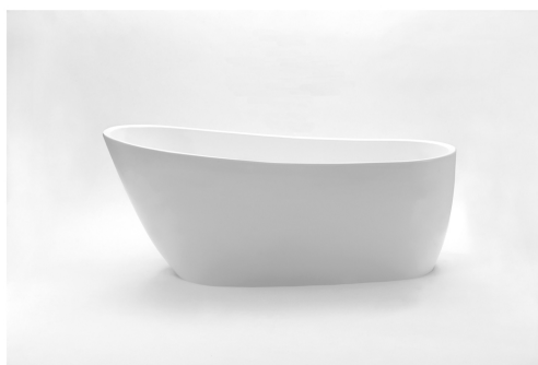
Kado Arc Freestanding Bath 1730mm – White

Dorma 2350 Door Stop to hinged doors fixed to skirting