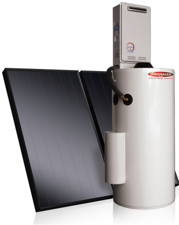
Chromagen Smartline 200 Lt Gas Boosted Solar Hot Water System, includes 2 No Blackmax collectors and 26Lt Gas Booster. (Natural Gas)

A solar water heater will provide up to 90% of your water heating needs, however all solar hot water systems utilise a supplementary heating source (boosting) to ensure you get dependable hot water in times of low solar contribution. The booster is typically fueled by gas or electricity and only activates when necessary to ensure the water temperature meets the set level.