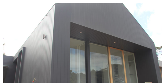
Weathertex Weathergroove 150 Smooth - Painted

Raven – RP 48 Perimeter Weather Strip (White) Raven – RP3 Bottom Door Seal (Silver)