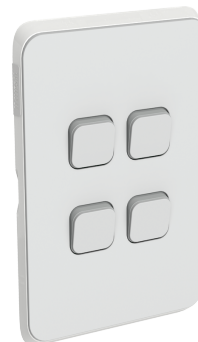
Clipsal Iconic Switches

We choose to utilise Clipsal Iconic Outlets throughout (Switches & Power Points) including 1 No 3 x USB Charger Shelf