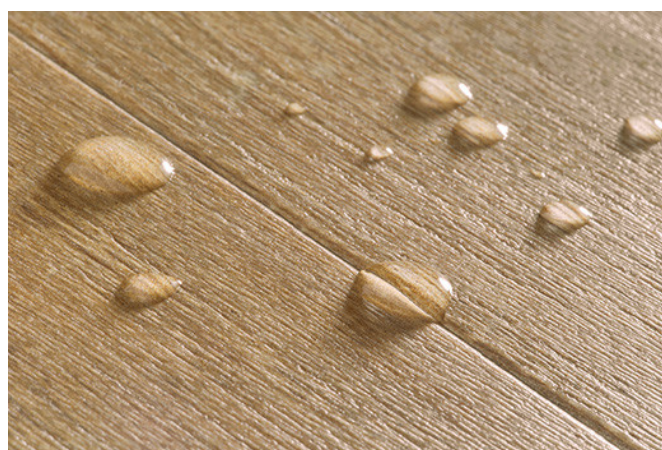
Quick-Step Impressive Ultra doesn't just look fantastic, it also performs amazingly well thanks to Quick-Step's advanced innovation technology - Water Resistant