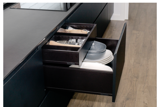
Inner Drawer within Pot Drawer