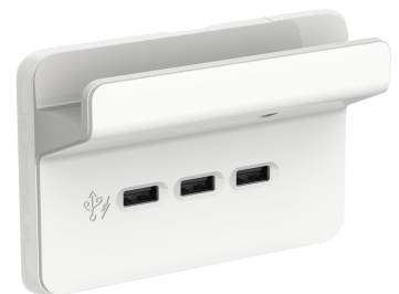
Clipsal Iconic 3 x USB Charger Shelf

LED Downlight SAL 90mm SALS9065TCWH (White Finish/Warm White Colour Temperature) Dimmable (Selectable Colour Temp Option switch within light settings for Cool or Daylight)