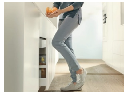
one-touch opening allows fronts to stay clean as waste goes straight in the bin